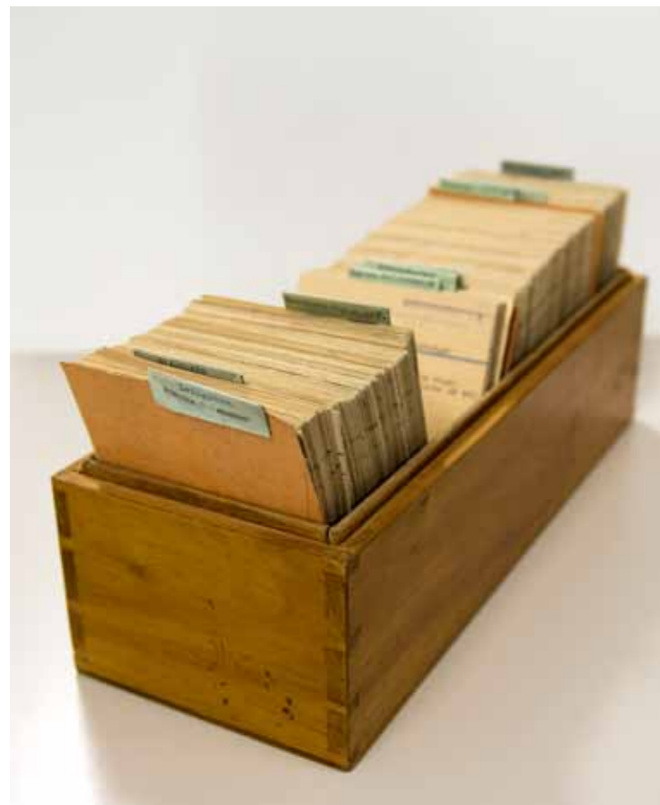
One of three boxes of cards itemising the collection of Alphonse von Rothschild. 000/2135